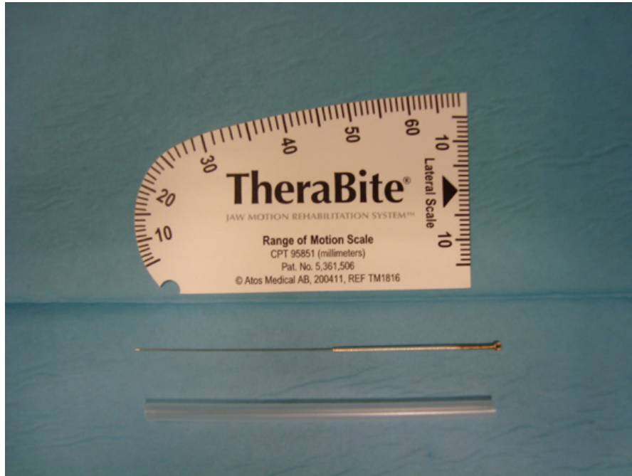
Fig. 1. Range of mandibular movements was measured with a TheraBite® ruler. For the DDN, sterile stainless steel needles (length 40 mm and caliber 0.25 mm, with a cylindrical plastic guide; Agu-punt®) were used.