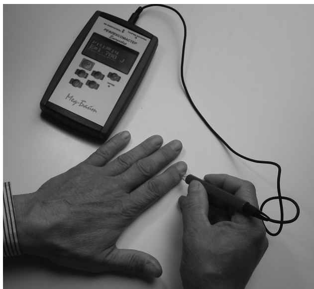
Figure 2 "Merid" device invented for the Akabane test by V.G. Muzhikov.

some additional hidden conductive tracts may possibly exist. The activating pulses from the atria move along these tracks, going straight to the ventricles and bypassing the AV junction blocks, thus causing untimely and rapid contractions of the ventricles. This mechanism is mostly responsible for the appearance of the WPW-type tachycardia's syndrome. Thus, this index can be seen to be very important when assessing the myocardium's conductivity mechanism. Conductivity disorders with a slow heart rate can be regarded as manifestations of the yin state whereas tachycardia can be regarded as a manifestation of the yang state.